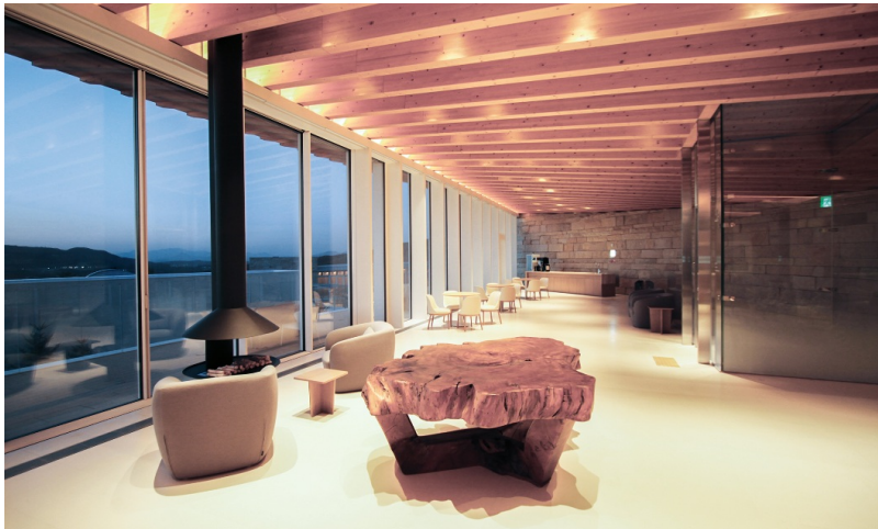
The distinctive timber beams on the ceiling create a pleasant atmosphere in the Recreation Centre's lounge.