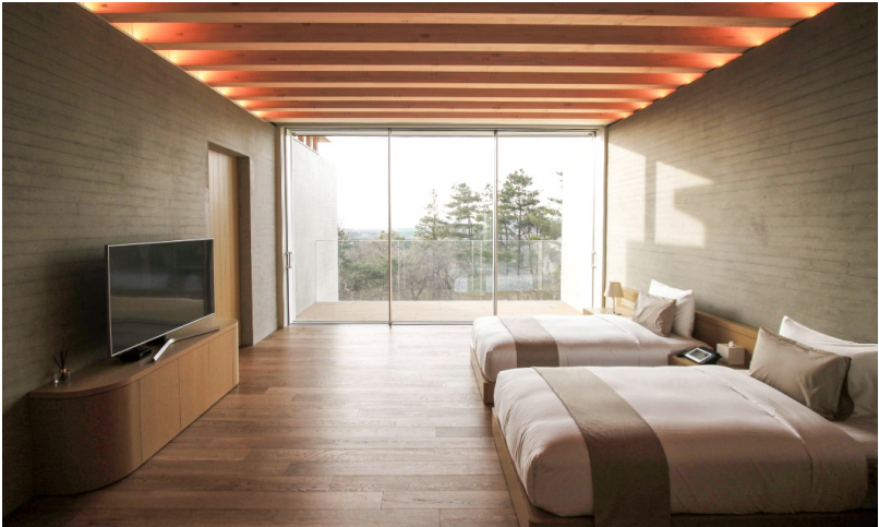
View inside a two-bed bedroom in the Timber House, Condo A