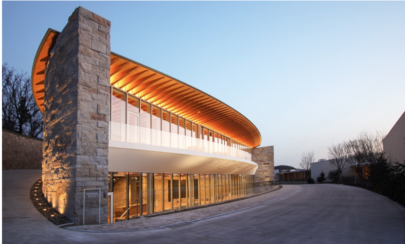
Haesley Nine Bridges Golf Club, Learning Centre at night