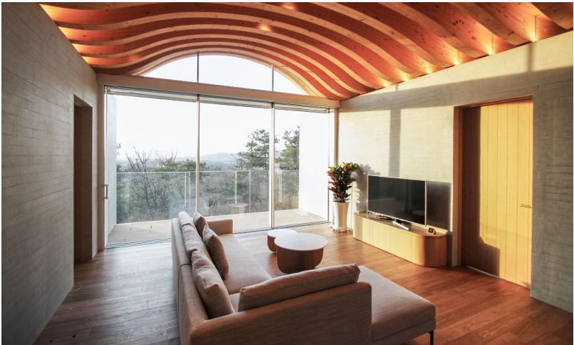
View inside a suite in the Timber House, Condo A