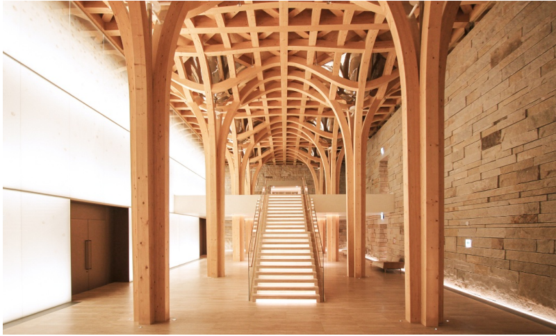
Stairs in the Learning Centre