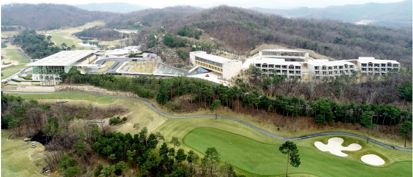
Bird's eye view of all buildings