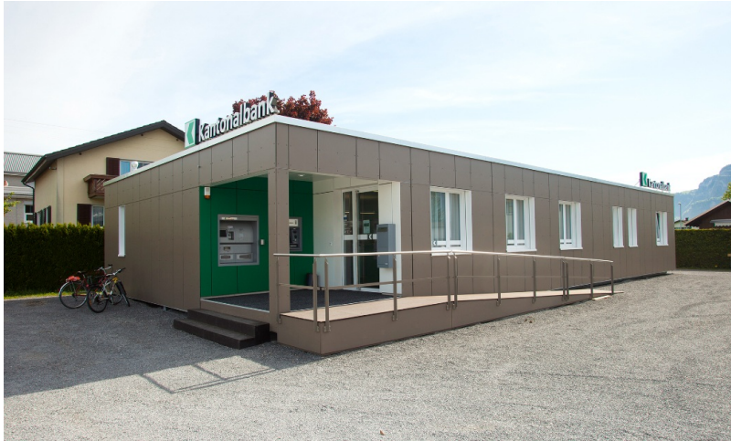
Entrance with wheelchair-accessible ramp