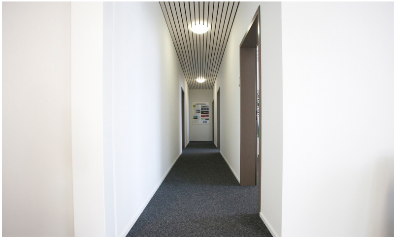
Bright corridors in the back office