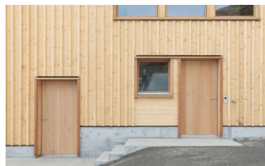
The self-service restaurant in the new timber building on the Carmenna alpine pass.