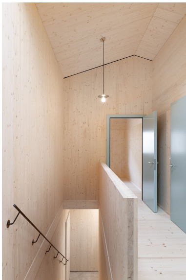
The two-storey section of the new building houses living quarters for staff working there.