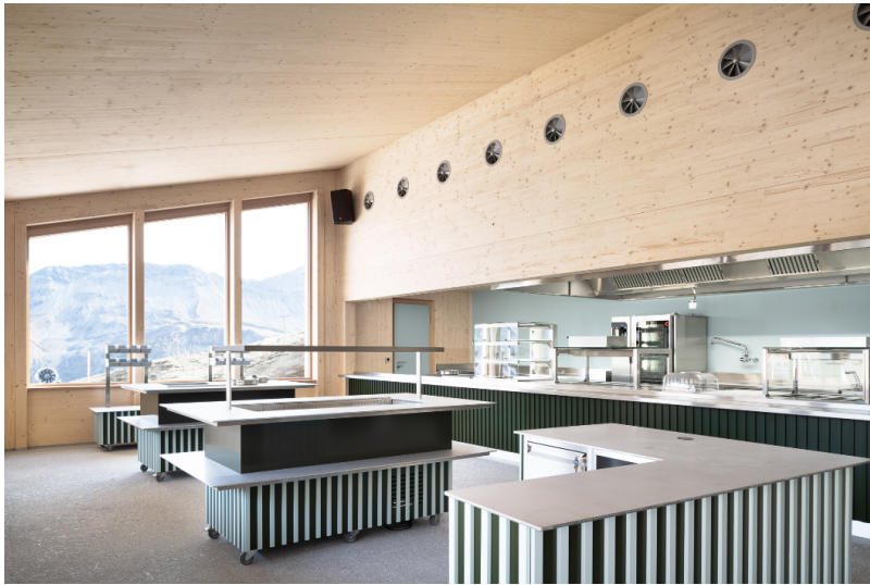
Dining area of the self-service restaurant constructed in solid timber.