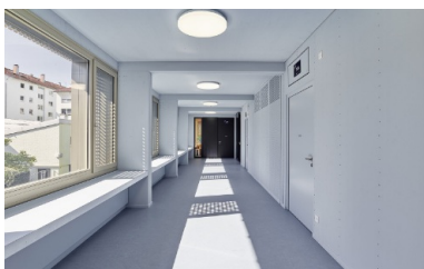
Spacious school hallway with bright windowsill to linger.