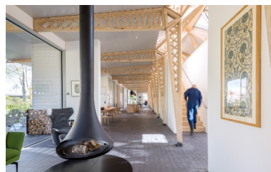
Close-up of the roof construction