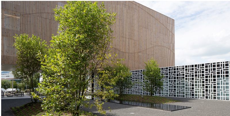
Facade design with vertical Douglas fir slats