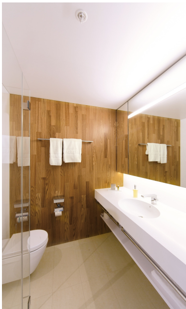
Bathroom module design