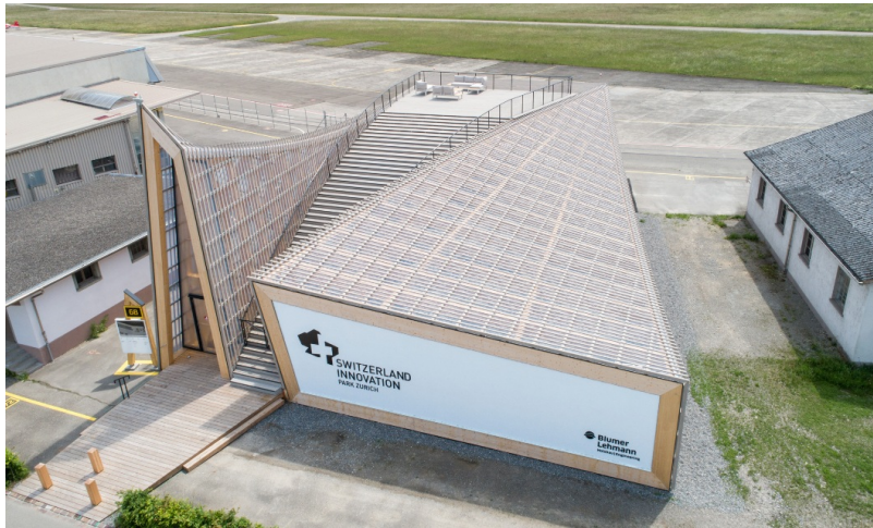
Lighthouse project for the Innovation Park