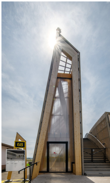
Entrance area in the free-form shell