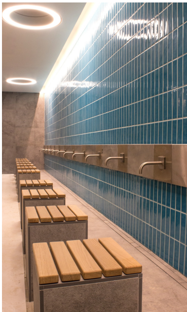
Place for the faithful to perform cleaning rituals