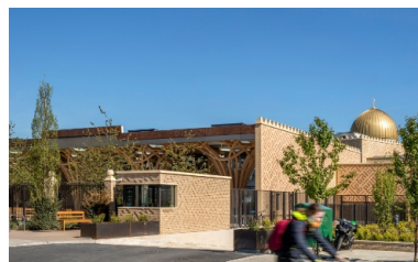
External view of Cambridge Mosque