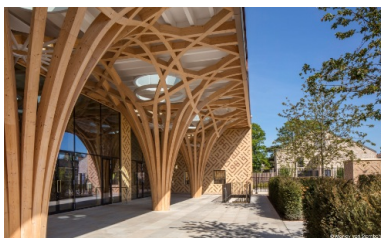
Entrance to the mosque