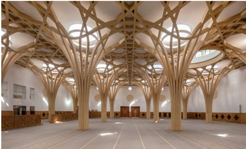
Prayer hall with free-form supporting structure