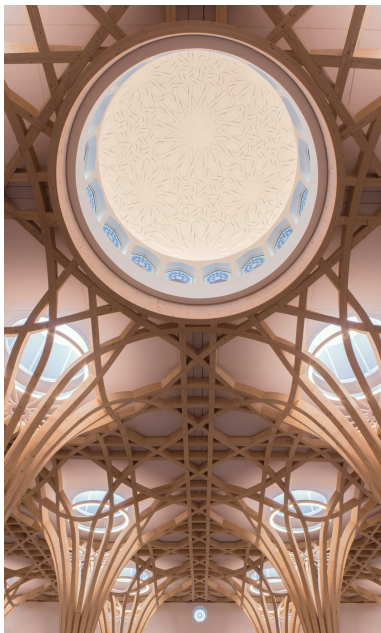
30 skylights bathe the mosque in light