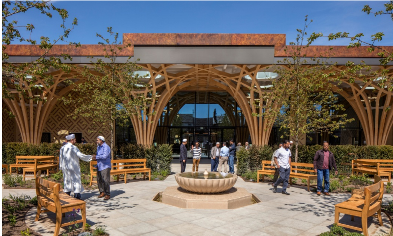
View of the mosque's atrium