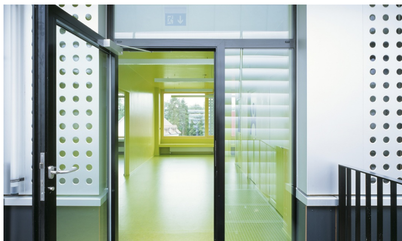
Spacious entrance area in the temporary school building