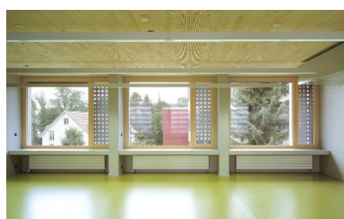
The large windows in the classroom ensure plenty of light.