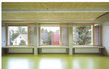
The large windows in the classroom ensure plenty of light.