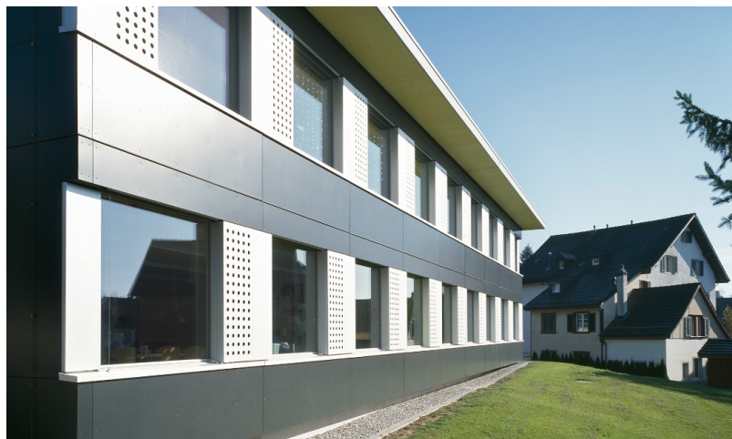
Temporary Hasenacker school building in modular design with facade in anthracite white