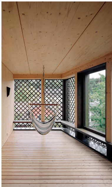
Wood also dominates the covered balcony.