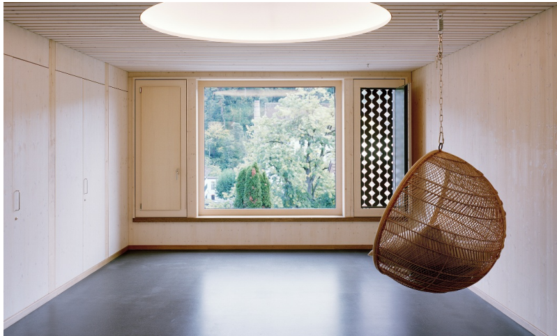
Comfortable recreational room in the residential home for deafblind people.