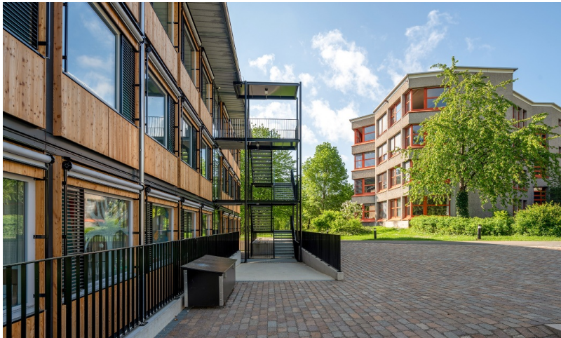
The school pavilion's different levels are accessed via an external staircase.